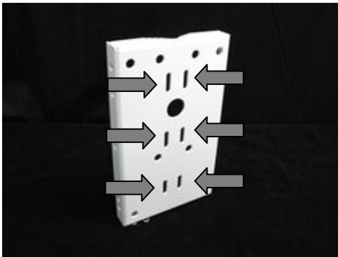
Strapping is threaded from rear thru slots indicated. Face view shown

BR-MPM2-AC (Accessory Sold Separately) Strap slots indicated by arrows