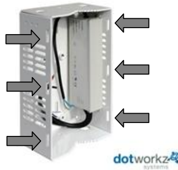
Image 2) Side Slots for Strapping Start strapping from rear, this view shows slot arrows from rear view

BR-MPM2-AC (Accessory Sold Separately) Strap slots indicated by arrows