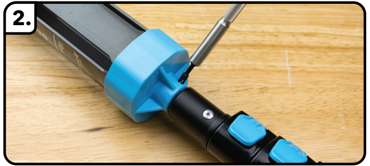
Place supplied grub screw in the small hole in the base and tighten.