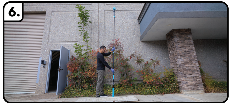
6. Extend (or retract) pole to desired height (only when pole is vertical).