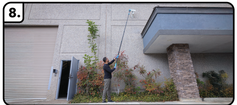
8. Clean desired surface quickly and safely. Retract and cover with transport bag when finished.

*Make sure to store your DomeWizard in bag when not in use.