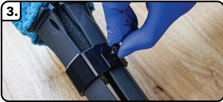
3. Loosen set screw, select desired cleaning mode, tighten set screw.