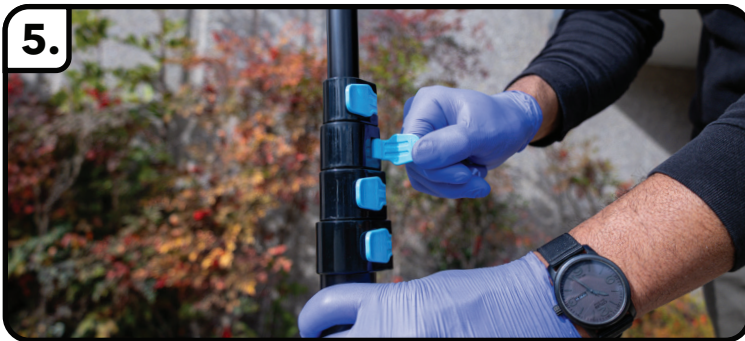
5. Open blue pole latches.