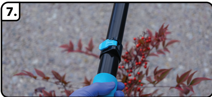
7. Close blue pole latches completely (to avoid pole collapse when in use).