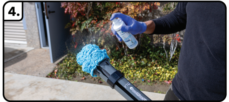
4. Apply Pro-Clean solution to mitt.