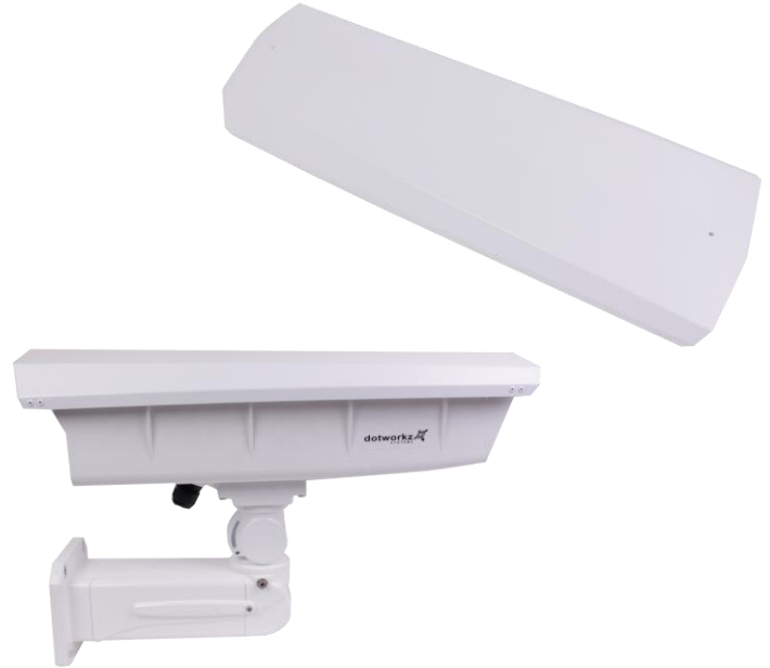
(S-Type Housing Sold Separately)