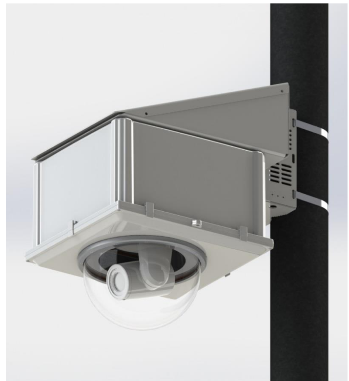
Pole Mounted HD12-CD-HB with example broadcast camera installed